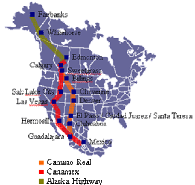
Map 2: The Central Western Corridor

Source: North American Forum on Integration Website; http://www.fina-nafi.org/eng/integ/corridors.asp