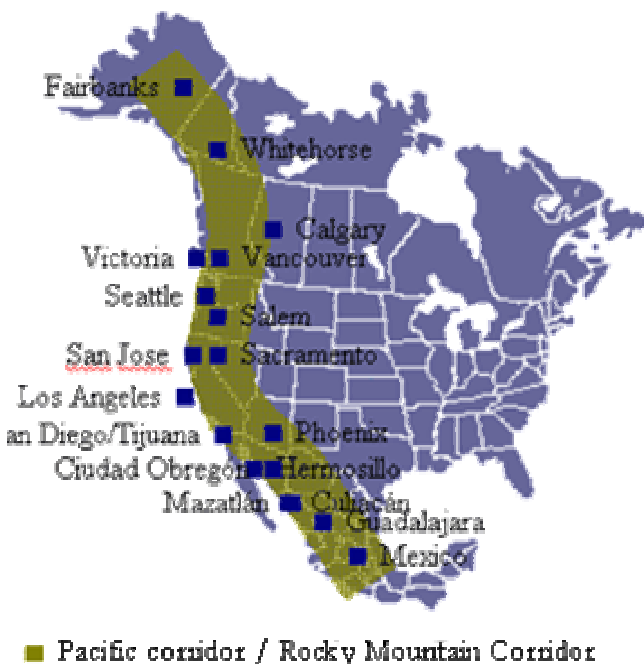
Map 3: Pacific and Rocky Mountain Corridors